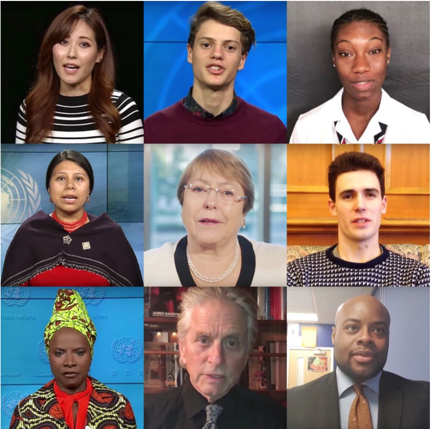
( https://www.un.org/en/udhr-video/ )

Watch and listen to people around the world reading articles of the Universal Declaration of Human Rights in more than 80 languages. ( https://www.un.org/en/udhr-video/ )